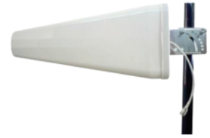
Outdoor Yagi Antenna