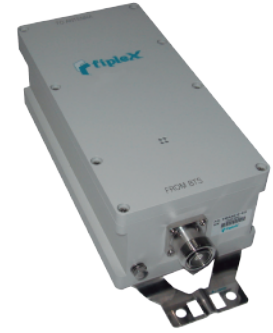
Dual Duplexed Tower Mounted Amplifier 700 MHz band