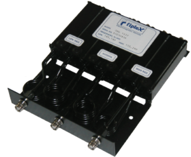
Mobile Duplexer DHL1533